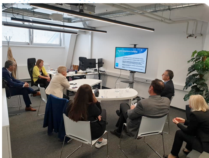
1. Visit at Digital Innovation Hub Slovenia

The B2B and Matchmaking event was accompanied with a heavy and comprehensive event programme such as Presentations of Slovenian AI, e-Gov projects and Digital Agenda Strategy by directors of Directorates for Information Society and Informatics of the Ministry for Public Administration, Presentation of Slovenian Smart Specialisation and Presentation of 5G education program, Cooperation between academia and business by University of Ljubljana, Faculty for Electrical Engineering, while the members of mission also visited the Digital Innovation Hub, the show room: Cyber Security and the Ljubljana Technological Park and Iskratel.