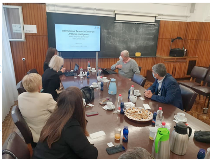
2. Visit to the Institute "Josef Stefan" and International Research Center on Artificial Intelligence in Ljubljana