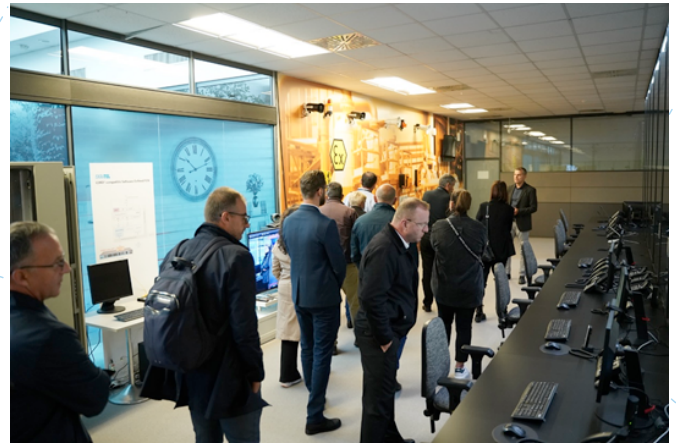
4. Visit at Iskratel